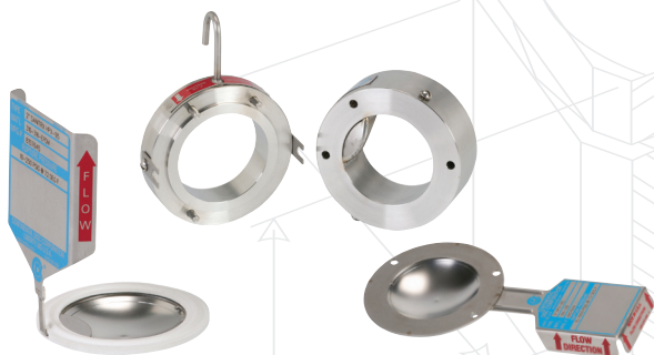
SANITRX HPX® RUPTURE DISC, HPX® INSERT HOLDER, HPX® RUPTURE DISC

There's no standard mold here; each pressure relief product is custom-designed based on each specific application. Our rupture discs and valves are rigorously tested to ensure you are getting just what you asked for - the best.