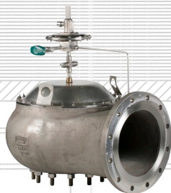
1660A PILOT OPERATED RELIEF VALVE